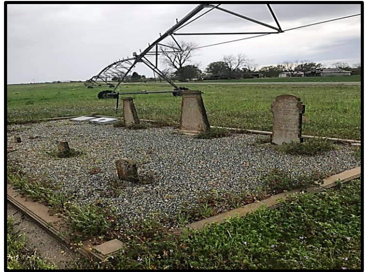
Moore Family Cemetery in Dooly County Markers from 1880 to 2016